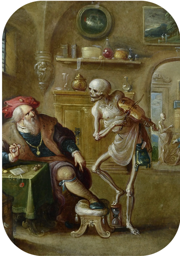
Death and the Rich Man by Frans II Francken (1581 - 1642), Oil on copper, Executed circa 1610